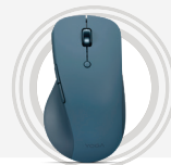
Lenovo Yoga Pro Mouse