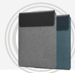
Lenovo Yoga Sleeves