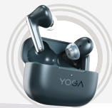
Lenovo Yoga True Wireless Stereo Earbuds